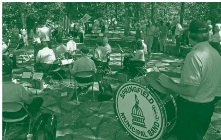
The Springfield Municipal Band provided a festive atmosphere to the birthday celebration.

Popular gifts featured last year were the scented wax pottery bowls and spheres. They provide a year's worth of fragrance without using a flame. There will be more fragrances to choose from this year and the wax spheres will be available in two sizes.