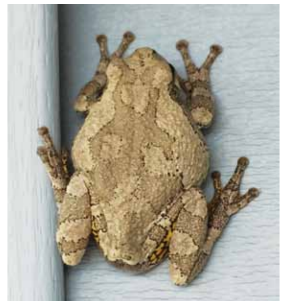
Right: Gray tree frog clinging to vinyl house siding. Note the yellow on its inner thighs.